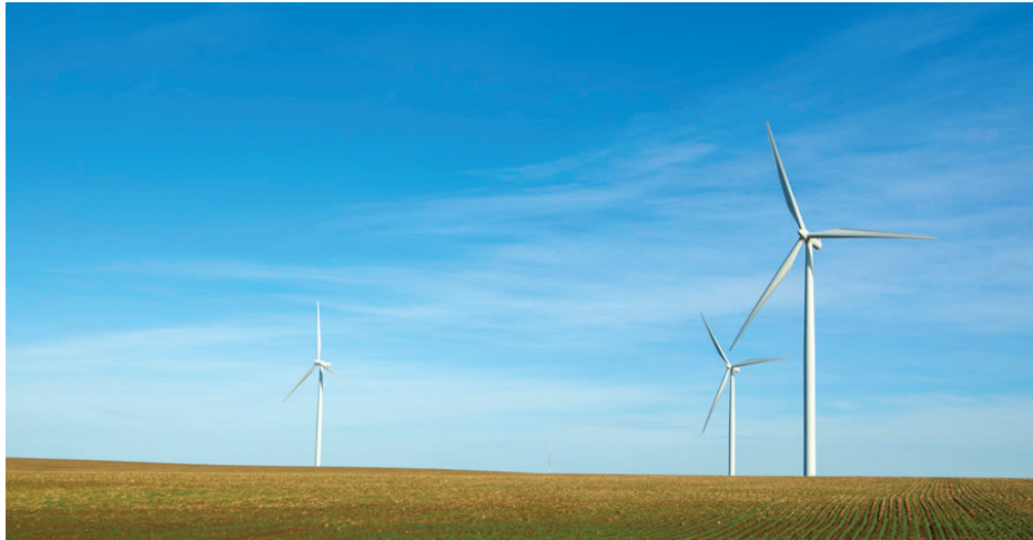
Vansycle II Wind Energy Center in Umatilla County